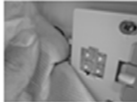
3. Dry contacts with cloth