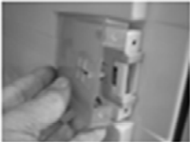
1. Remove cover