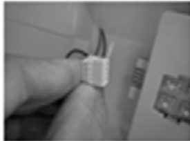
2. Remove connector