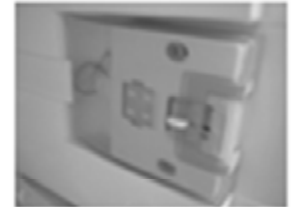
4. Re-assemble light box