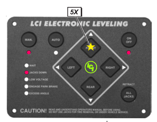
Push the "FRONT" button ★5 times.

MANUALLY LEVEL the coach. Turn the TOUCH PAD "OFF" . Turn the TOUCH PAD "ON" again. This readies the TOUCH PAD for reprogramming the LEVEL ZERO POINT.