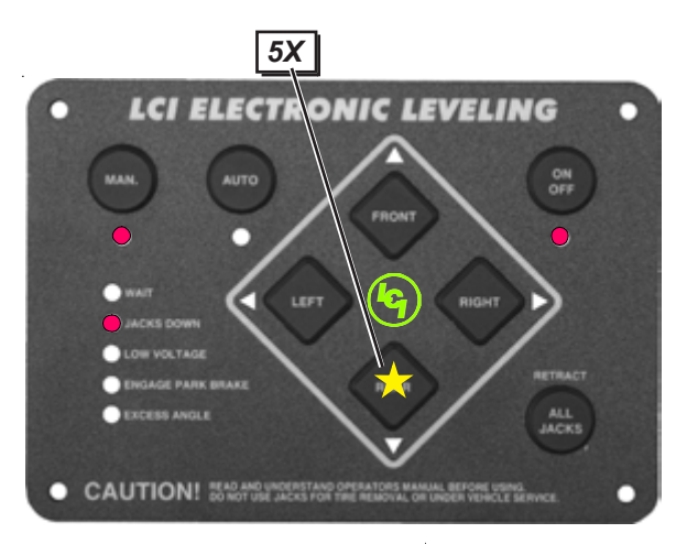
Push the "REAR" button ★5 times.