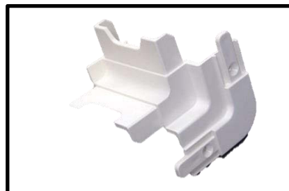
R854760 Molded ABS Corner – White