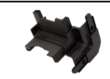
R854860 Molded ABS Corner - Black